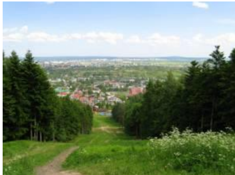
Some views on the City of Kielce