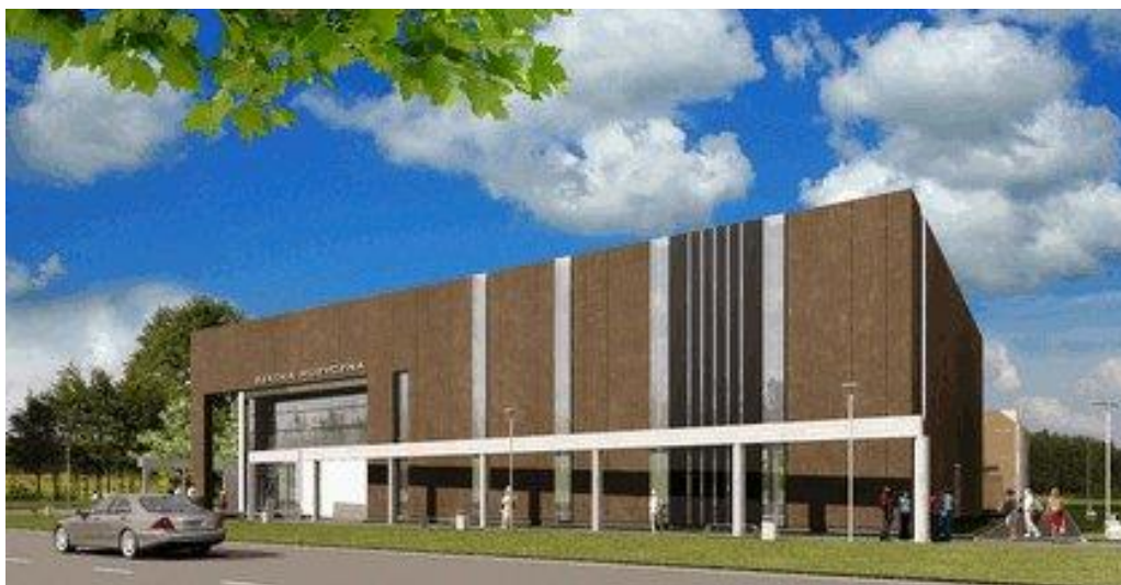
The main building of State College of Music in Kielce/Poland